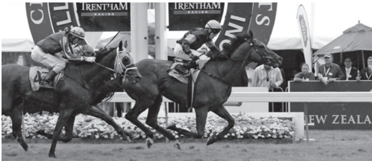
SPIRO winner of the Wellington Cup

The three day Manawatu RC Christmas racemeetings was again plagued by bad weather but this did not stop quality horses winning over the carnival. On the first day the New Zealand Bloodstock Filly of The Year, KINGS ROSE would destroy a top field to win the Group Three $70,000 Ezibuy