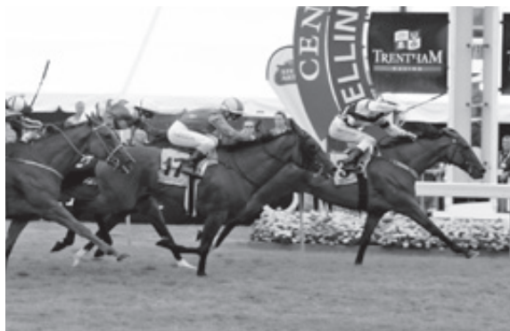
BOOMING winner of the Thorndon Mile and Zabeel Classic

The autumn arrived and the Wellington RC Ladies Day would be an all female affair with MIDNIGHT OIL providing