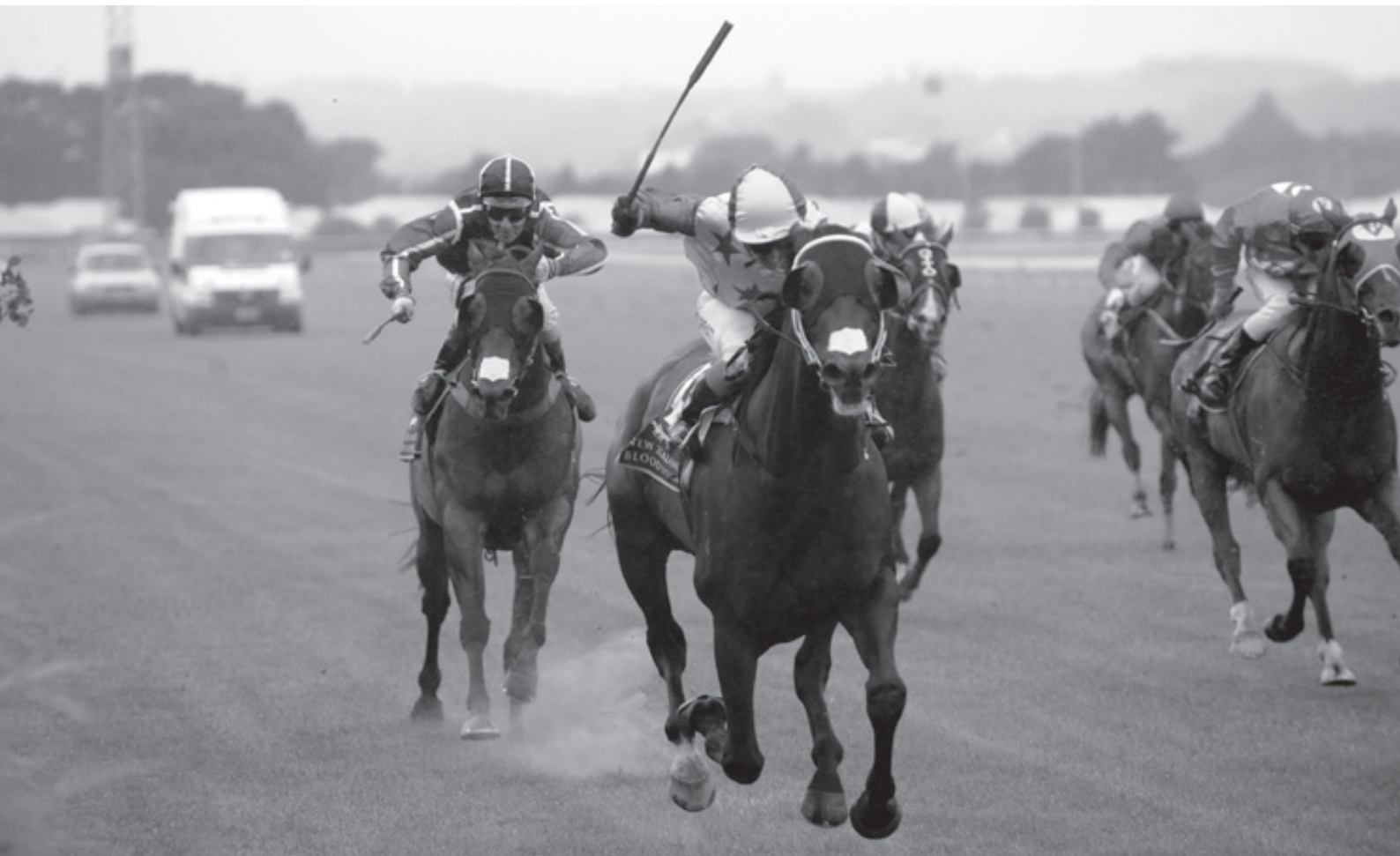
MUFHASA winner of the Telegraph Handicap

Century City Wellington Cup day would see the rain arrive eventually at the end of the day, but not before some exciting action took place on the track. DATING would defeat a high quality field in taking out the $70,000 Group Three Desert