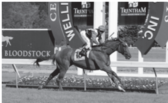
WE CAN SAY IT NOW winner of Captain Cook Stakes