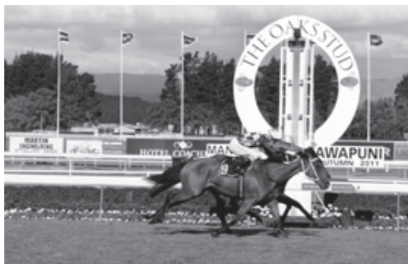
ANNABADANA winner of the Manawatu Sires Produce Stakes

Winter racing would see DANCING JESS take out the James Bull Rangitikei Gold Cup at the Rangitikei RC May meeting. For her connections it was mission accomplished after going into the race last year as one of the favourite only for the meeting to be abandoned a race earlier. Jumping