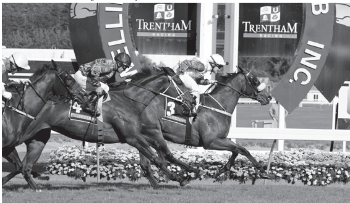
MIDNIGHT OIL winner of the Wellington RC Ladies Day