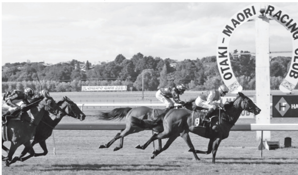
KEEP THE PEACE winner of the Otaki-Maori Group One WFA

The Manawatu RC Sires Produce raceday is billed as one of the best of the autumn and this year proved no different. The Oaks Stud Stallions Manawatu Sires Produce Stakes is the grand final for two-year-old racing. This $200,000 Group One